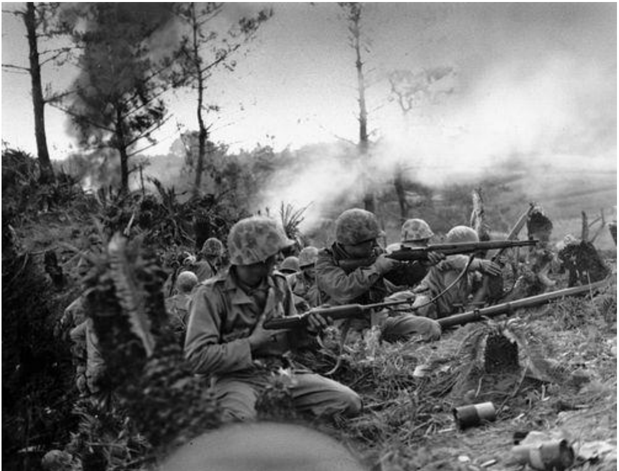
U.S. Marines are shown on Guadalcanal, 1942.