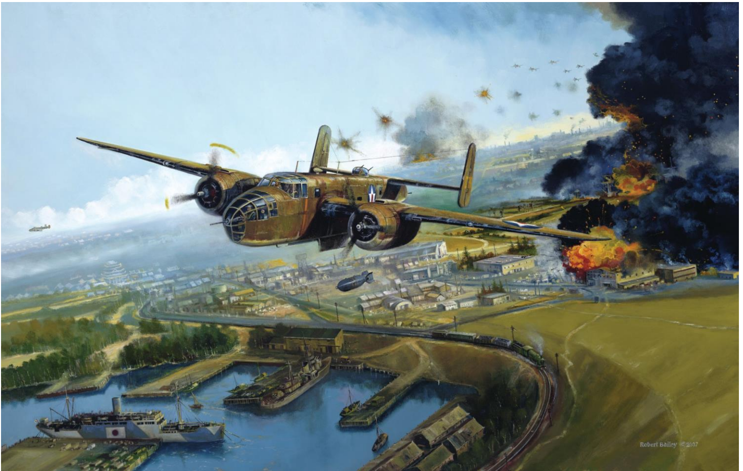
U.S. B-25 Mitchell bombers over Tokyo on April 18, 1942.

WEBQUEST Directions: Using the internet, as well as the textbook and information from class discussions, fill in the blanks correctly.